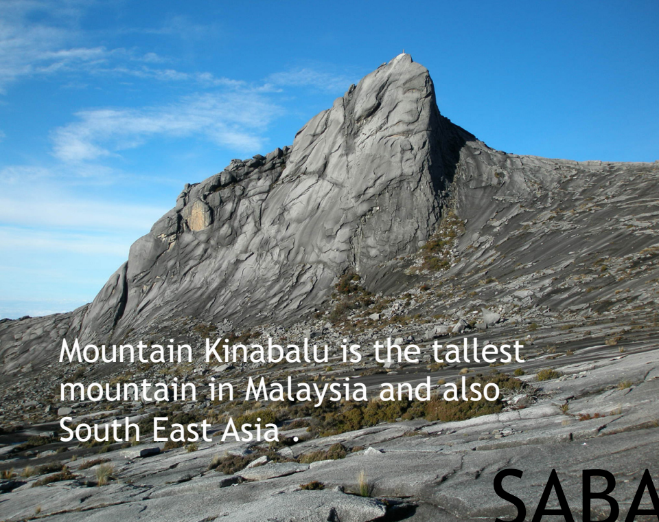
Mountain Kinabalu is the tallest mountain in Malaysia and also South East Asia .