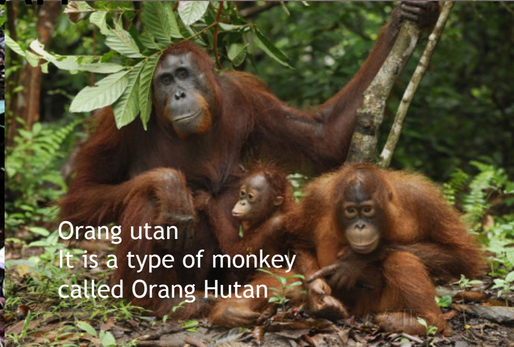
Orang utan It is a type of monkey called Orang Hutan