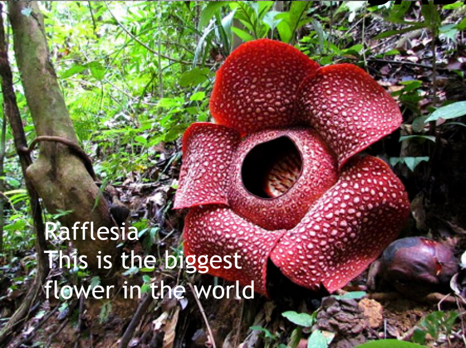
Rafflesia This is the biggest flower in the world