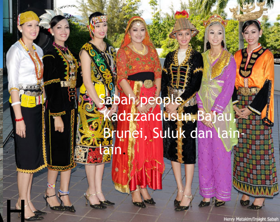
Sabah people Kadazandusun, Bajau, Brunei, Suluk dan lain- lain.